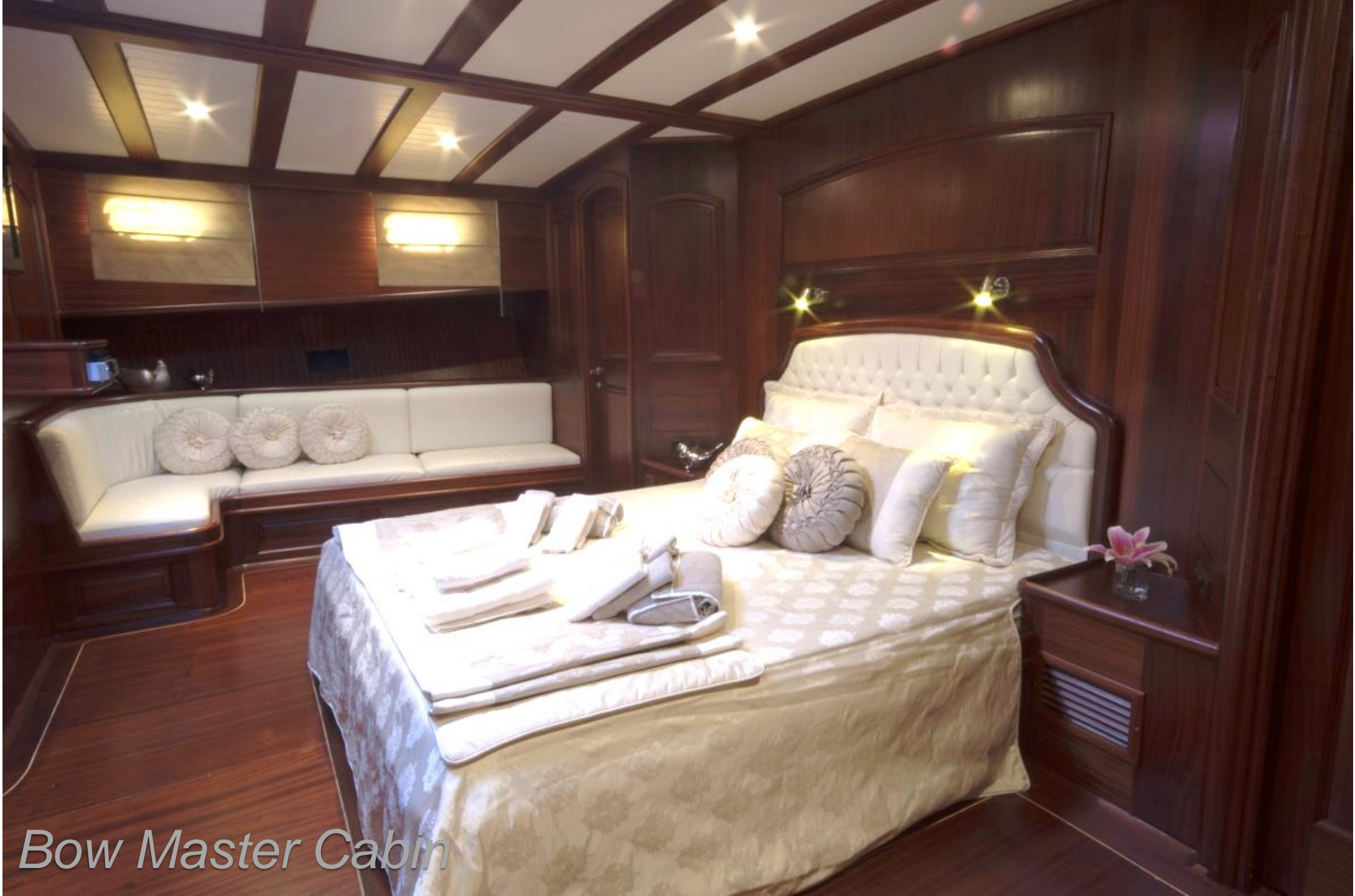
Bow Master Cabin