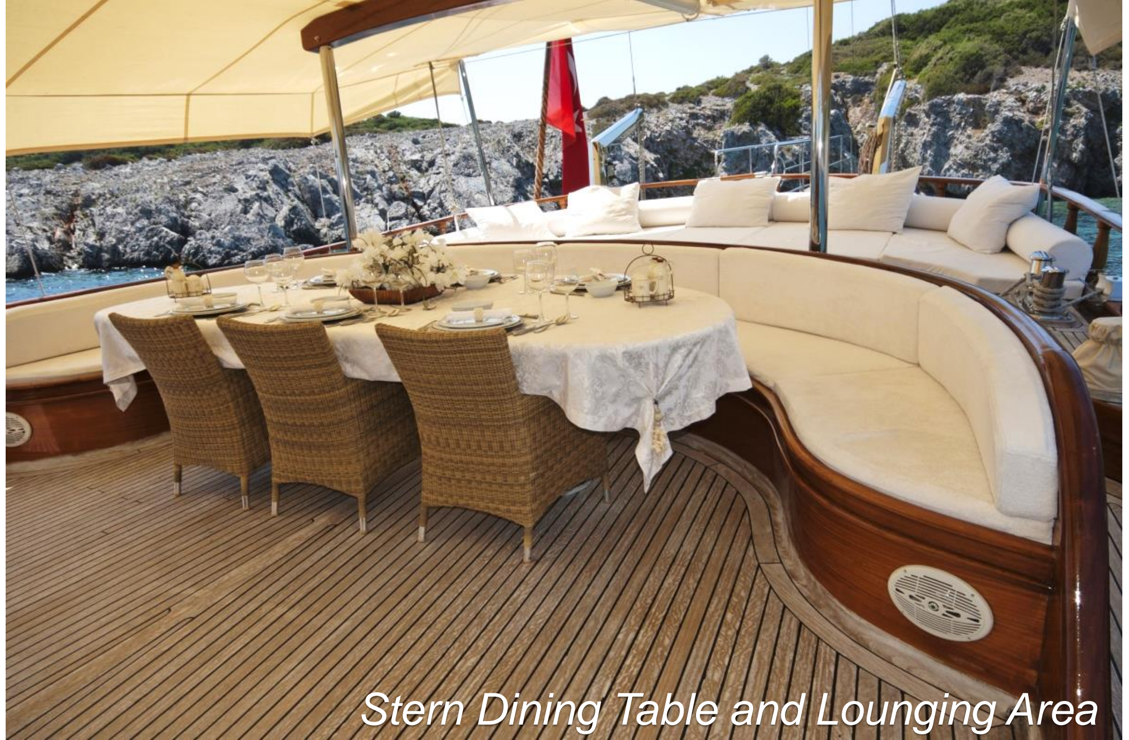
Stern Dining Table and Lounging Area