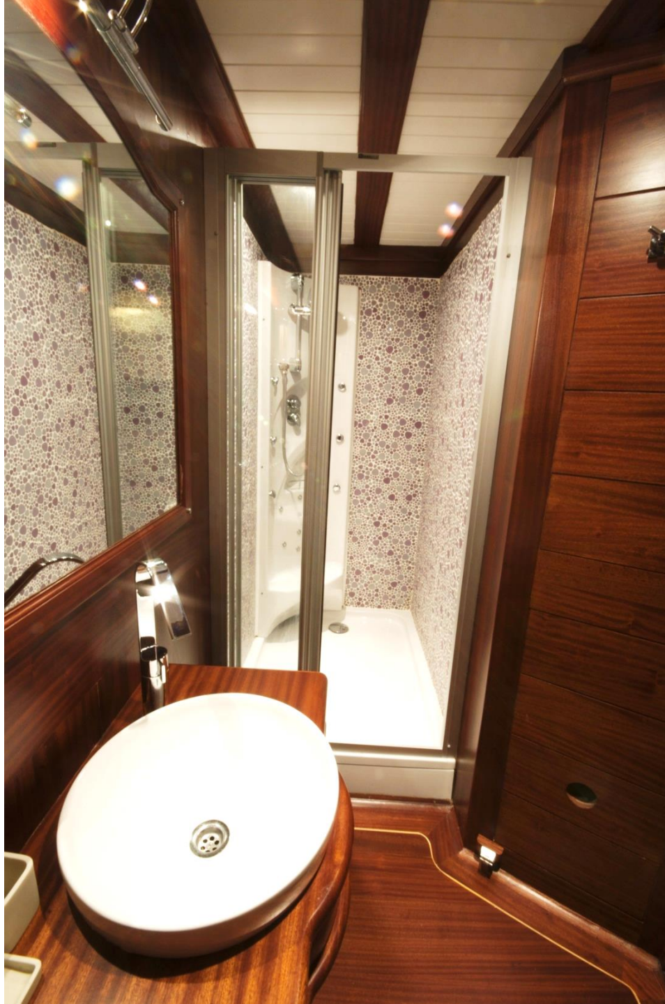
Master Cabins en-suite shower, bath, head