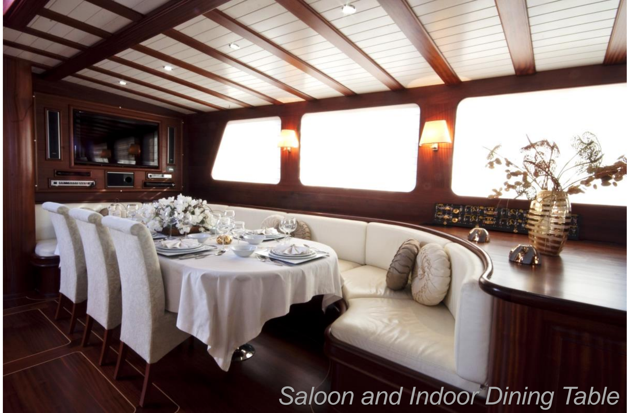
Saloon and Indoor Dining Table