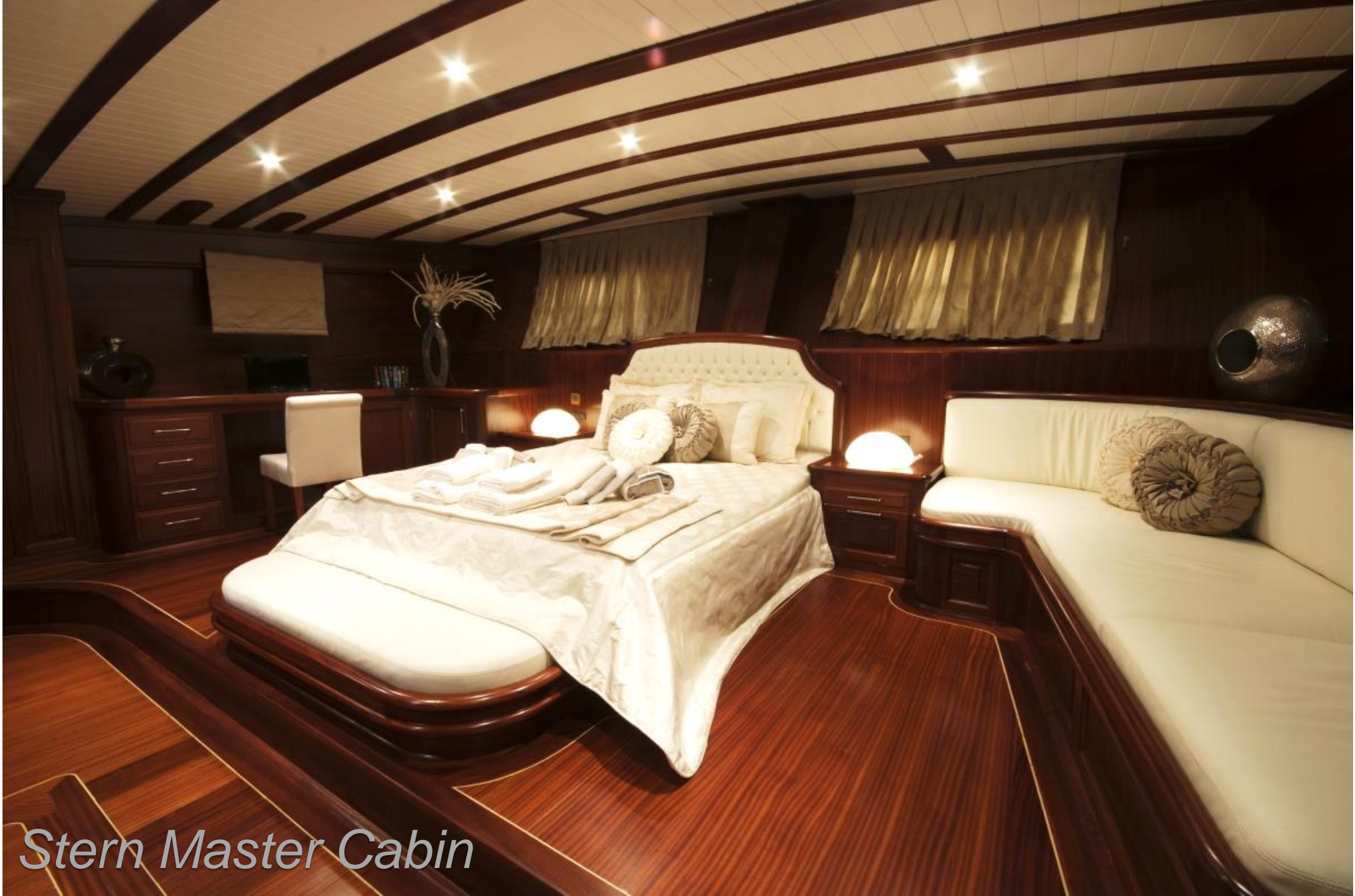
Stern Master Cabin