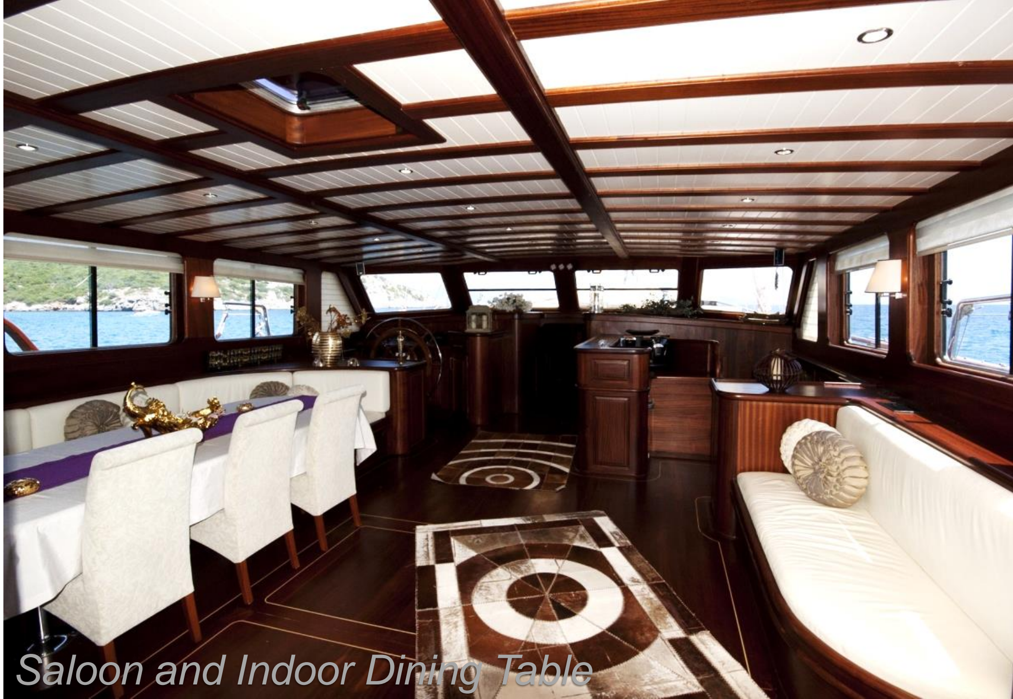
Saloon and Indoor Dining Table