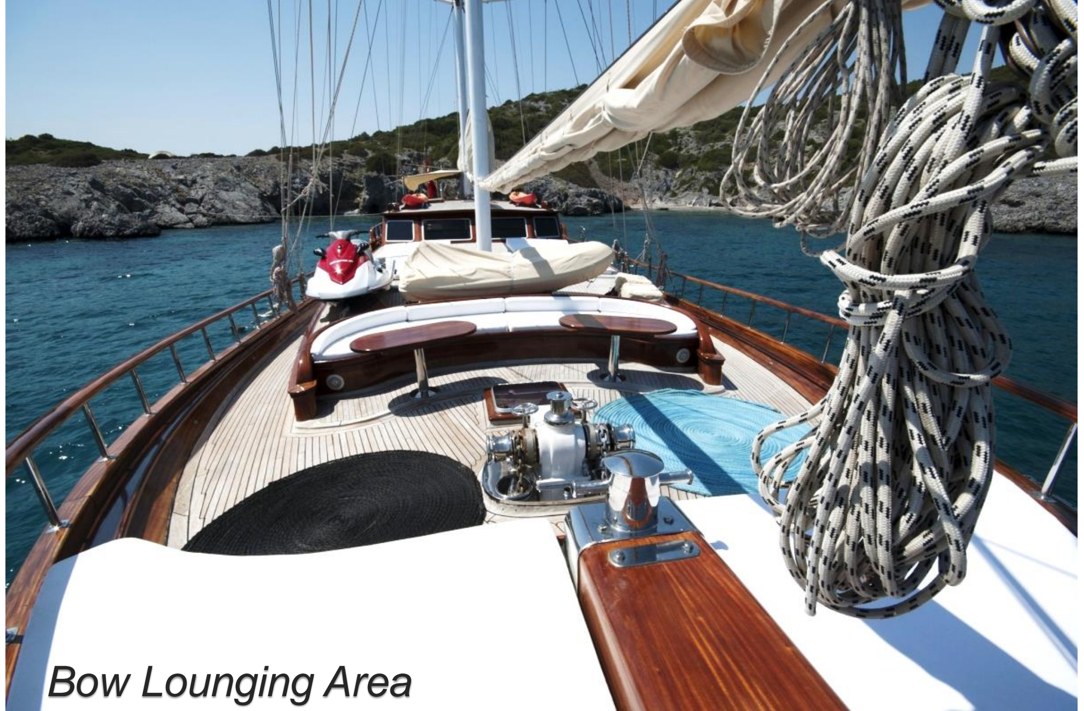
Bow Lounging Area